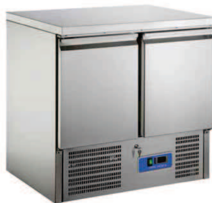
S901 S/S TOP