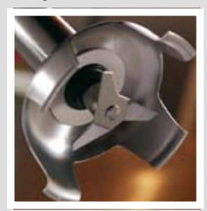
Special lipped design of the blade protection