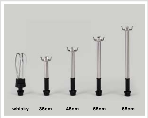
A wide range of tools