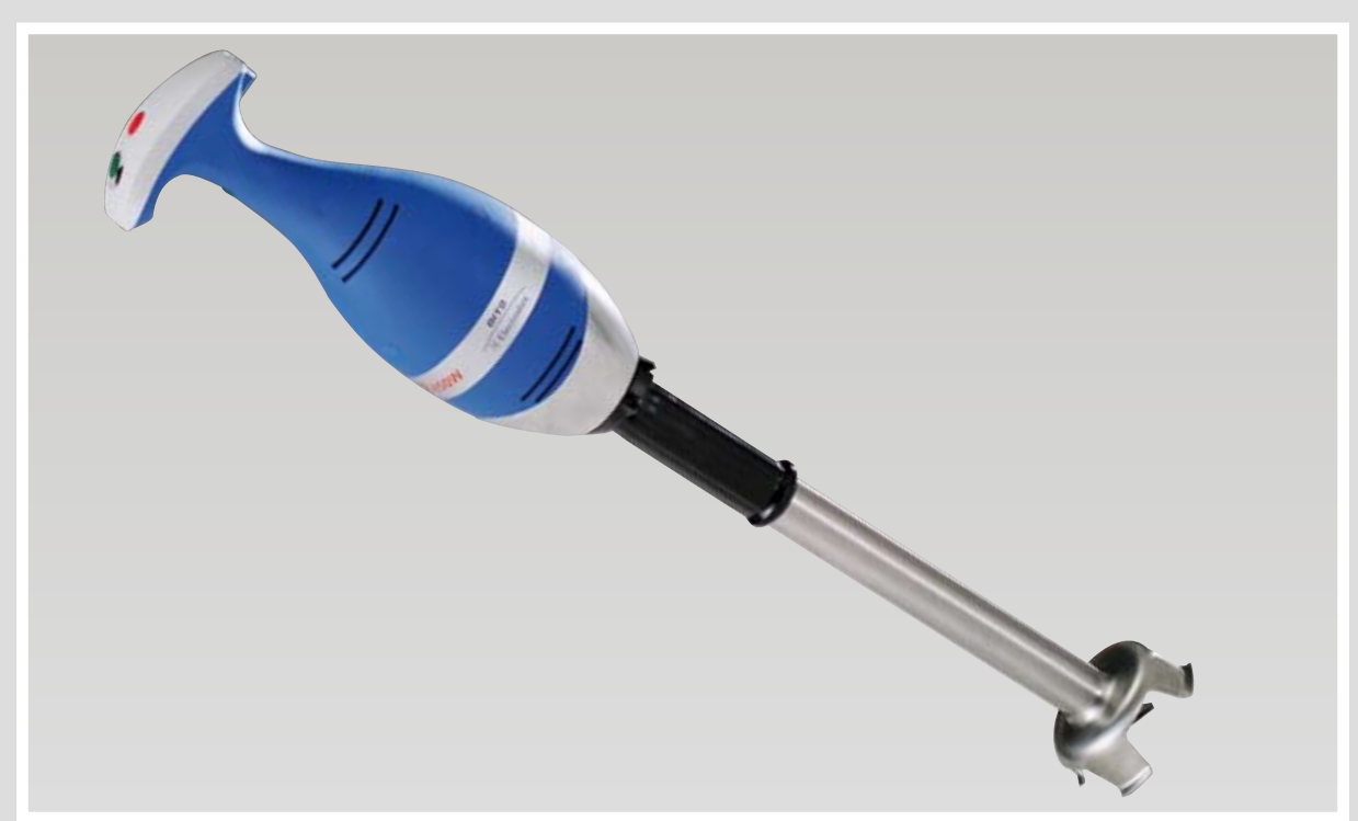
Portable mixer with stainless steel tube

With the Dito Electrolux portable mixers you will save time and money by using a multifunctional and easy to handle tool. Portable mixers give you the possibility to serve a great variety of high quality foods quickly and easily.