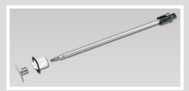
Tube can be completely disassembled without tools to facilitate cleaning