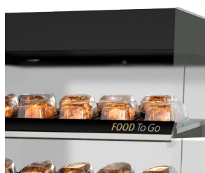
Stylish black canopy