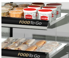
Optimum product visibility