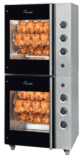
Also available: Stacked TDR 5 + 5 M