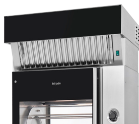
Ventless hood (optional)