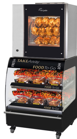
5 M with self-serve heated display