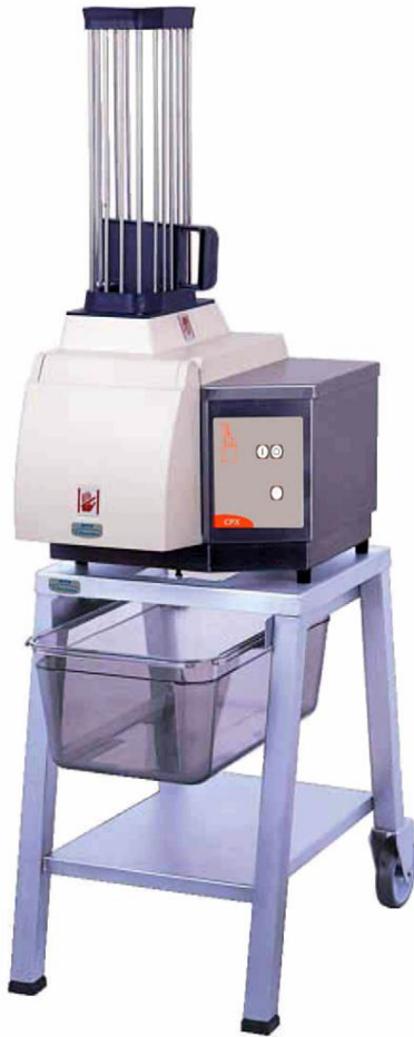
CPX + Optional Table