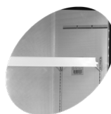
Scanner profile as standard